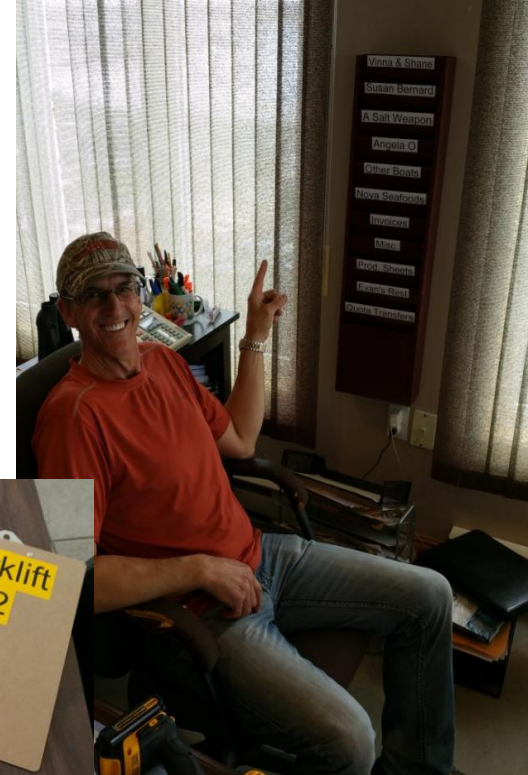
Evan's Fresh Seafood