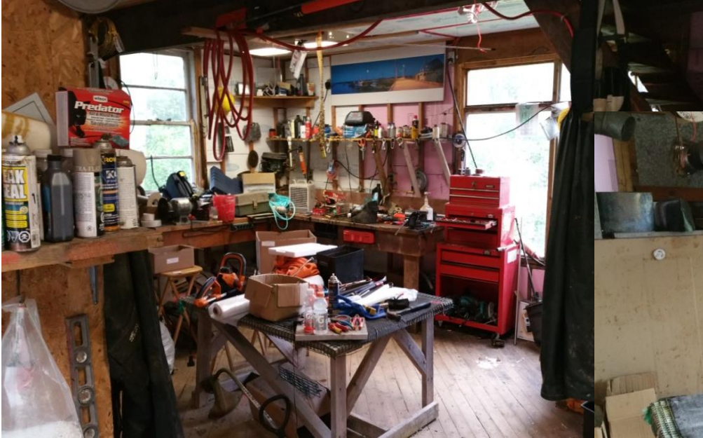
Eel Lake Oyster Before