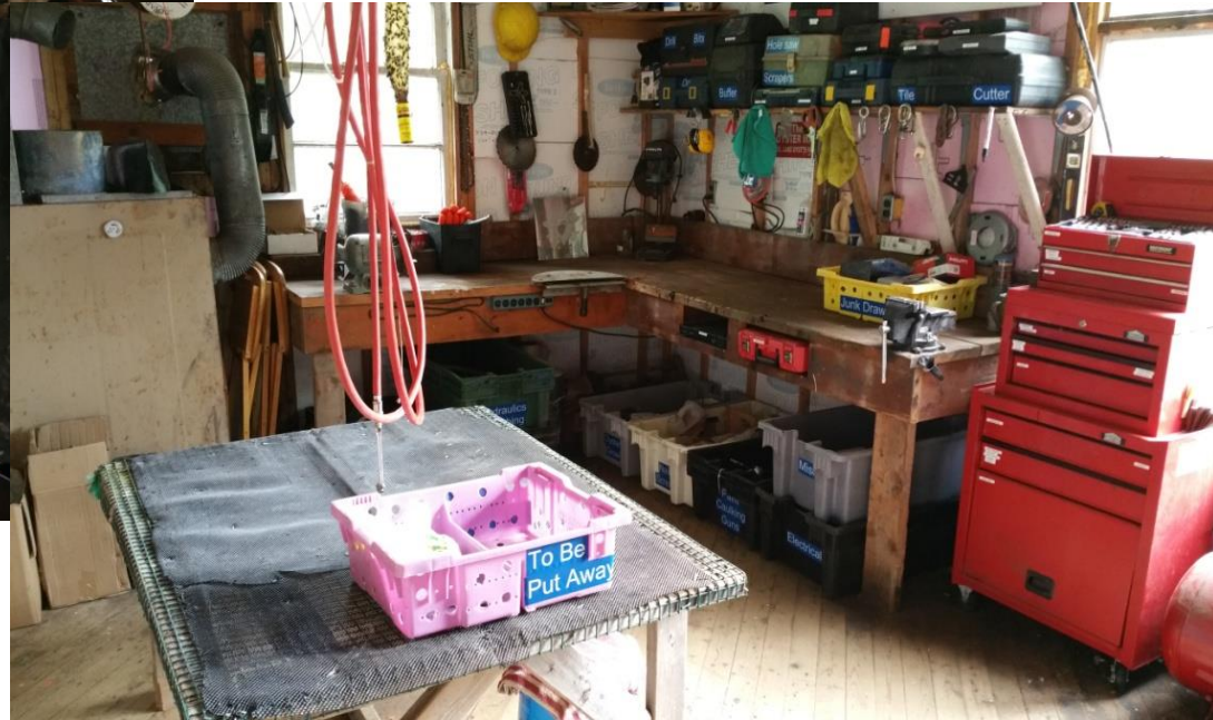
Eel Lake Oyster After