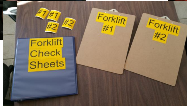
IMO Food's Ltd