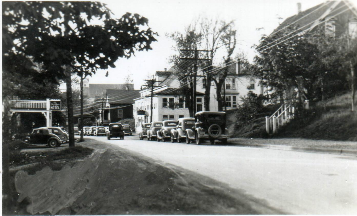
NORTH GRANVILLE STREET, PORT HAWKESBURY, CAPE BRETON, N. S., CANADA 42-3